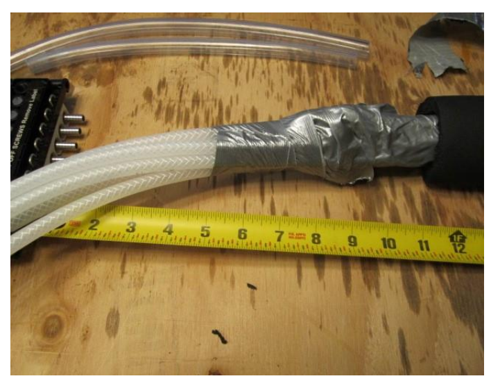
Tightly duct tape the U bend to keep the air out all the way up to within 5"- 9" of where the manifold is located.