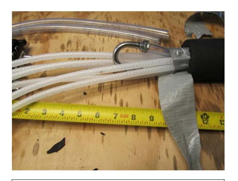
Untape to expose clear lines and shorten to 9"-12" away. Install U bend with clamps and crimp.