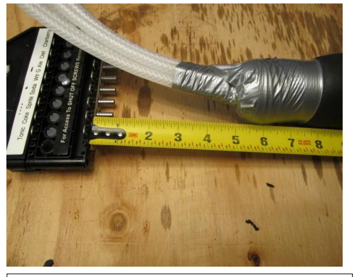
Tightly duct tape the insulation to the rest of the lines to keep the air out. If this is not done correctly the duct line will pull in moisture and cause the duct line to sweat. VERY IMPORTANT!